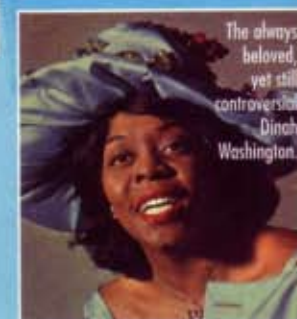
The always beloved, yet still controversial Dinah Washington.