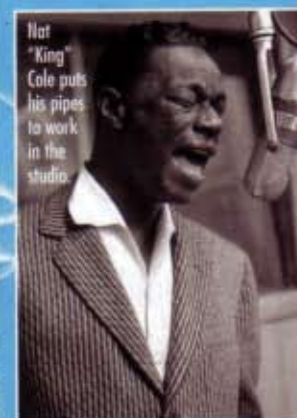
Nat "King" Cole puts his pipes to work in the studio.