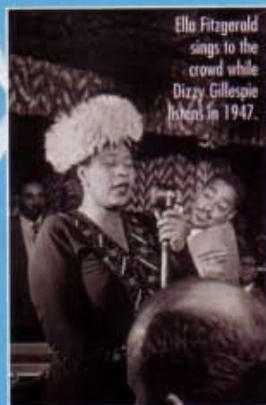
Ella Fitzgerald sings to the crowd while Dizzy Gillespie looks on in 1947.