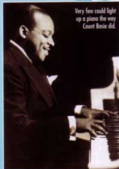
Very few could light up a piano the way Count Basie did.