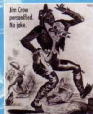
Jim Crow personified. No joke.